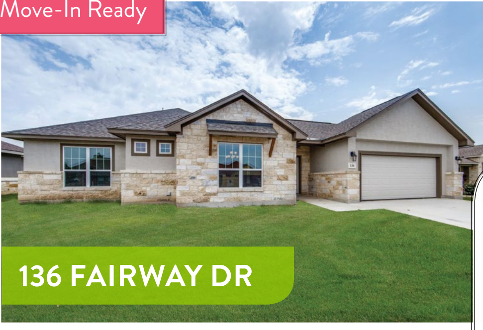
136 FAIRWAY DR

1 YEAR MEMBERSHIP ** 1 year free Golf Course Membership