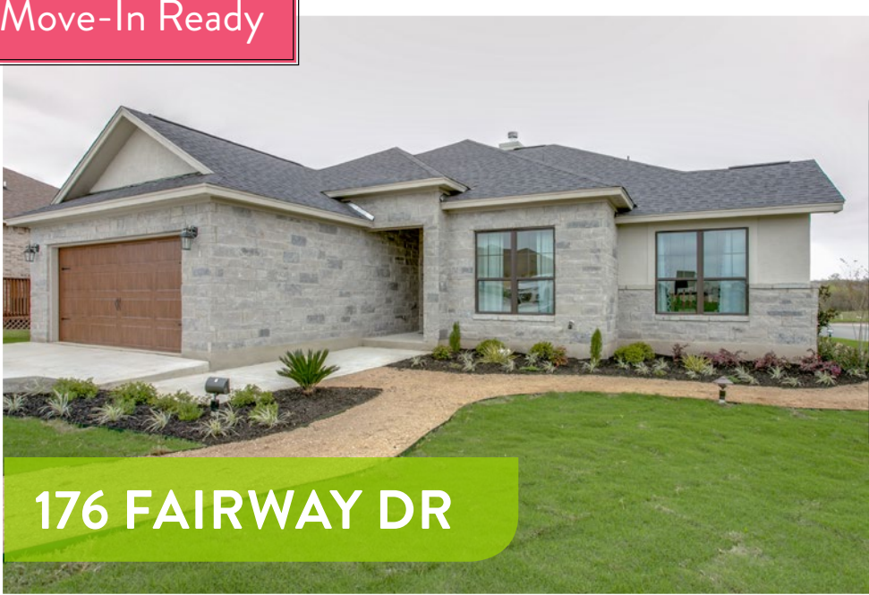
176 FAIRWAY DR

$4,000 TO $6,000 BUYER ALLOWANCE *** Buyer receives between $4,000 to $6,000 Buyer Allowance under this promotion